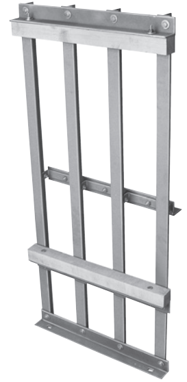
T-Bar Guide System 012-1500